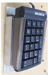
EB-3 Keypad Bracket

Width of LCD: _____ Height of LCD: _____ Thickness of LCD at Top: _____ Taper Type: _____ LCD Make / Model # _____ Special Notes: _____ Quantity: _____